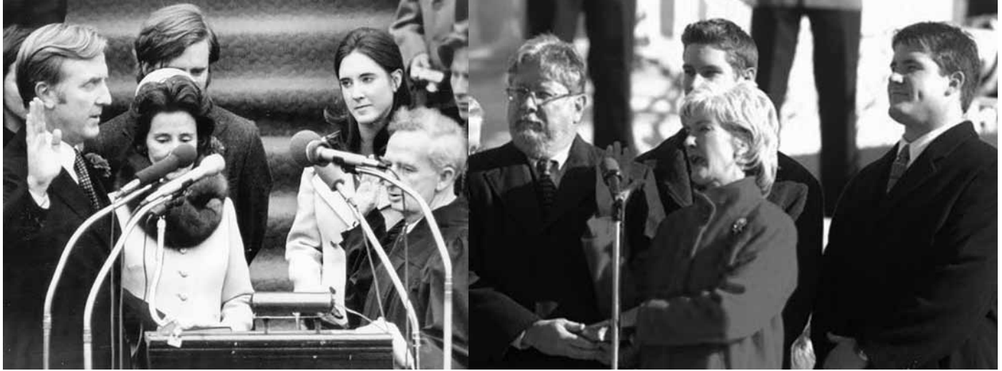
On January 11, 1971, Kathleen Gilligan looked on as her father was sworn in as the sixty-second governor of Ohio. A Democrat, Governor Gilligan lost his bid for reelection in 1974, but he taught his oldest daughter “that it’s important to have a moral compass. It’s important to have courage enough to take a stand on issues that are serious and defining,” explained Sebelius. “And even if you lose, it’s not the end of the world.” Almost thirty years later, when she took the oath and assumed the Kansas governorship, Governor Sebelius (picture here with her husband and two sons in January 2003) and former Governor Gilligan became the only father and daughter ever elected as governors.

activity in our family—it was sort of mandatory. We went door-to-door and put up yard signs. I thought that’s what everybody did in the fall, and it only came to me later in life that there were people who actually went out to picnics and went to football games and didn’t spend their time in call rooms and phone banks! From a very early age, we were around my father’s campaigns, so there was a lot of full-contact sport in our family. That actually turned out to be very lucky for me because when I began to run for office, you could bring my siblings in, drop them at any vicinity in the state, any room at any place, and they could run a call bank, they could go door-to-door; I had these wonderfully trained and skilled volunteers. Other people had to go hire people—I just called my family.