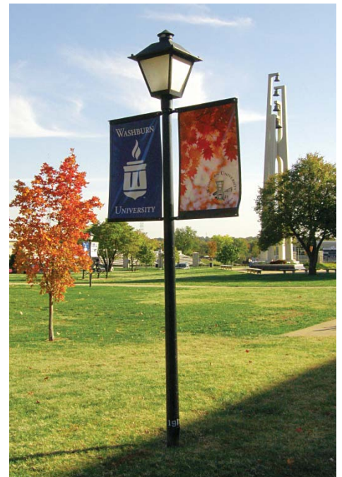
above: Fall day, Washburn Commons