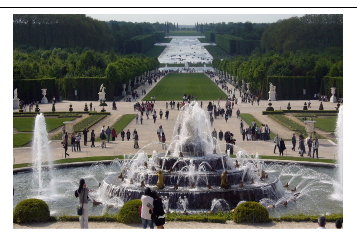
The beautiful fountain in Versailles.

At first I questioned my ability to participate in a study abroad. I now consider the study abroad experience as one of the best adventures in my life. In fact, I am planning a return trip next summer to visit my new Parisian friends. I encourage all students to research study abroad options. It is never too late to participate in study abroad.