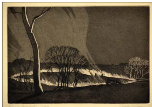
"Picnic Incident" by Charles Capps, 1942, etching and aquatint

Both etchings and aquatints are printed by the intaglio process. First, ink is rolled onto the plate and flows into the etched lines or areas. The top surface of the plate is then wiped free of ink. Wet paper is placed on the plate. The paper and the plate are run through a printing press, forcing the