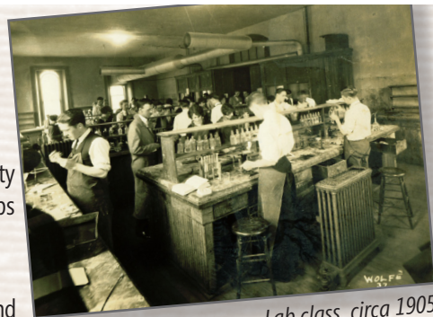
Lab class, circa 1905

1913: Night shirt parades are the rage as students don ankle-length sleeping attire and run down Kansas Avenue.