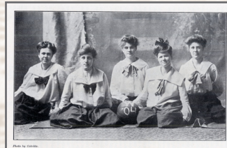
Women's basketball team, 1902

2011: Aug. 22: All University Convocation and barbeque; classes begin The past: 1886: The first telephone is installed on campus, but "young ladies" were not permitted to receive communication through the device.