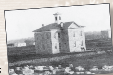
Lincoln College and Preparatory School, 10th and Jackson, 1867