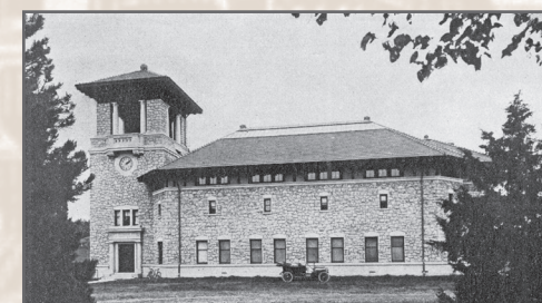
Thomas Gymnasium, circa 1909

1912: Sagamore, the senior men's honor society, is founded.