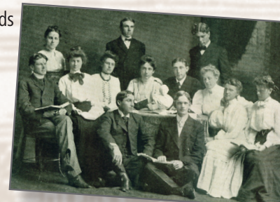
Washburn College Literary Society, circa 1890