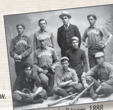
Baseball team, 1888

1910: Kansas Beta Chapter of Phi Delta Theta organized.