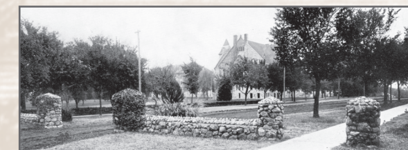
Stone gate to campus, 1908