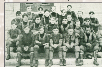
First forward pass team, 1905

1911: Washburn's men's basketball team wins state college championship.