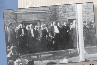
President Taft dedicates flag pole, 1911

2011: Sept. 5: Labor Day holiday (university closed) The past: 1866: First two college students enroll at Lincoln College.