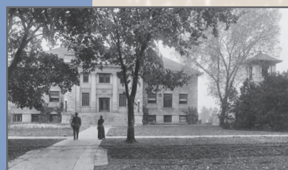
Carnegie 1910; Thomas Gymnasium tower on right