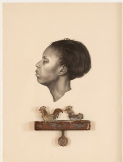
Whitfield Lovell Kin XLVI (Follie) , 2011 conté crayon drawing, shooting gallery target Bowdoin College Museum of Art

Whitfield Lovell combines conté crayon drawings and found objects to revitalize lost histories in his Kin series. In Kin XLVI , Lovell pairs an object used for target practice with a drawing of a Black woman in profile. This juxtaposition suggests a narrative about the anonymous sitter, drawing inspiration from images Lovell collected from the period between the Emancipation Proclamation and the civil rights movement. The woman’s profile is paired with a shooting gallery target, prompting one to consider the history of violence on the Black body.