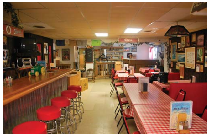
Interior of Mo's Place with brewing area below the Coors sign. Len does sell a limited variety of domestic beers, but most of the beer he sells he makes.