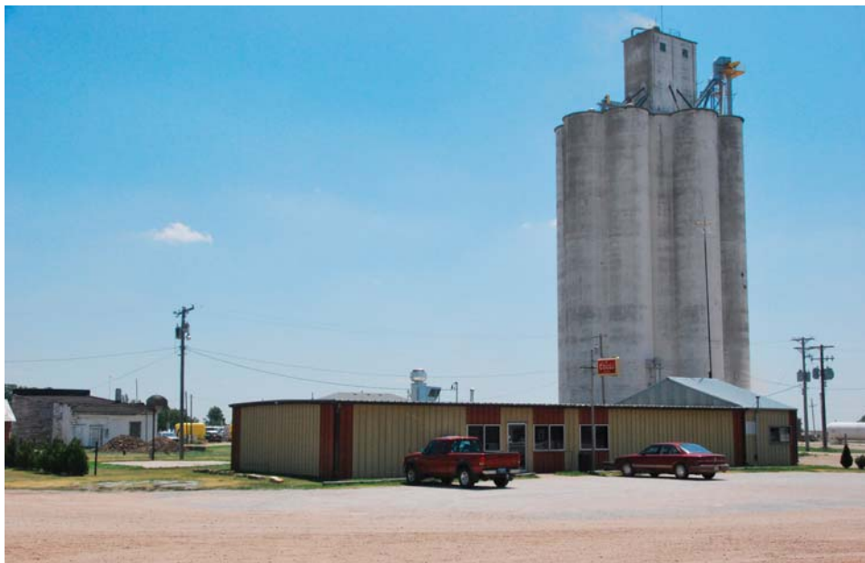
Mo's Place on Elm Street in Beaver. The grain elevator in the background is the only other business in town.

the beginning. Three days after opening, because of a gas leak and fire, they had to replace an old stove with a new one costing $5,000.