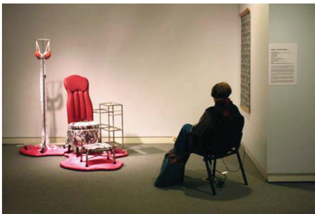
A visitor experiences the breast-cancer tableau at the opening reception for The Waiting Room: lost and found on January 13 at the Alice C. Sabatini Gallery in Topeka.